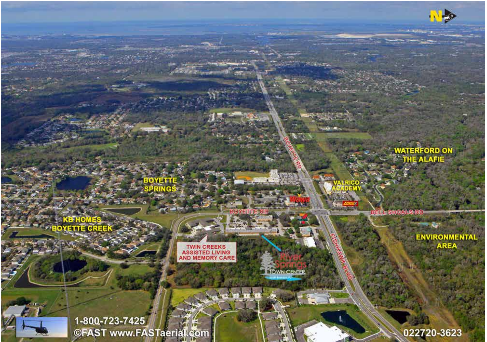
River Springs Town Center is surrounded by many upscale housing subdivisions. These include Boyette Creek, the KB Homes development with 584 homes; Boyette Springs with 1,100 homes; the Waterford on the Alafie neighborhood with 62 homes; and the luxurious Fishhawk Ranch.